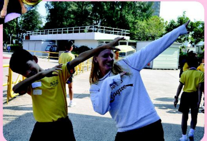
Sports Day in 2017