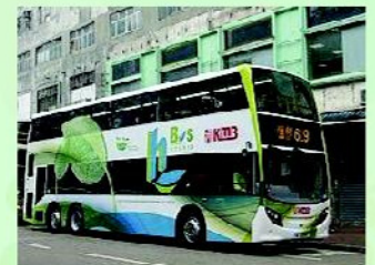
KMB ENVIRO500 hybrid