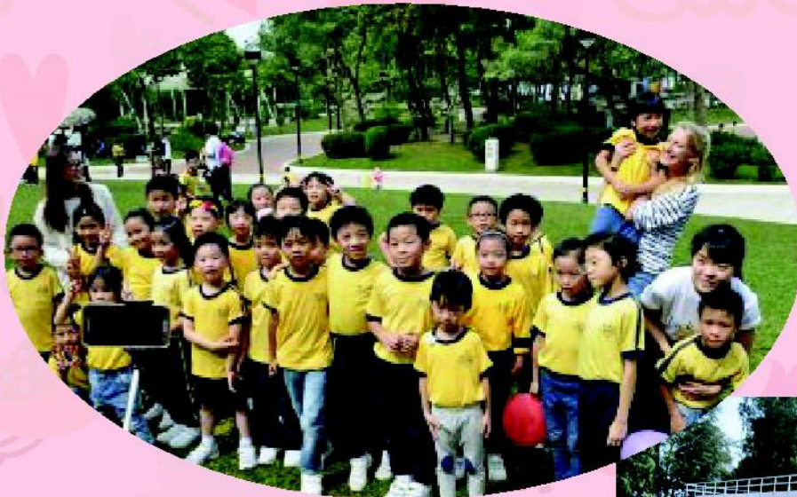
Picnic Day in 2017

"Amazing, authentic food in the heart of HK! We loved this place and will definitely be going back!"